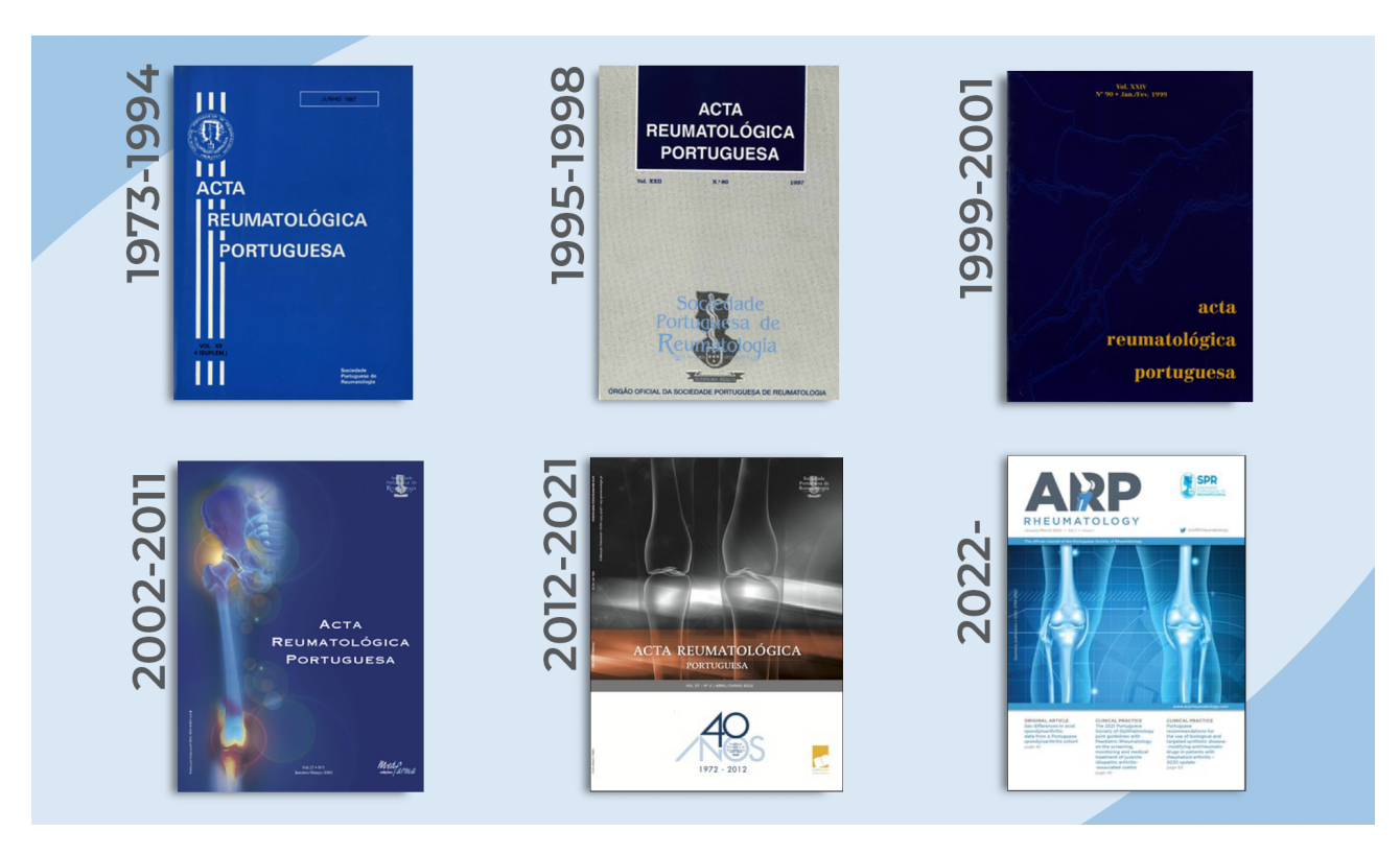
Figure 1. Diferent images of ARP in 50 years

a conference by the Portuguese Health Secretary on Rheumatology, Peace, Democracy, and the Armed Forces Movement in the context of the Portuguese revolution of 1974<sup>5</sup>.