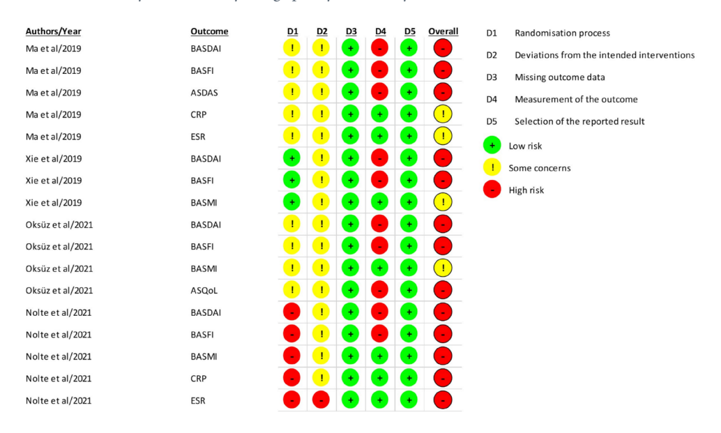
Figure 2d . Risk of bias for each article outcomes using the Cochrane Risk of Bias Tool(continued) - BASDAI: Bath Ankylosing Spondylitis Disease Activity Index; BASMI: Bath Ankylosing Spondylitis Metrological Index; BASFI: Bath Ankylosing Spondylitis Metrological Index; ASDAS: Ankylosing Spondylitis Disease Activity Score; CRP: c-reactive protein; ESR: Erythrocyte sedimentation rate; SF-36: 36-Item Short Form Health Survey; ASQoL Ankylosing Spondylitis Quality of Life

Figure 2c. Risk of bias for each article outcomes using the Cochrane Risk of Bias Tool (continued) - BASDAI: Bath Ankylosing Spondylitis Disease Activity Index; BASMI: Bath Ankylosing Spondylitis Metrological Index; BASFI: Bath Ankylosing Spondylitis Disease Activity Score; CRP: c-reactive protein; ESR: Erythrocyte sedimentation rate; SF-36: 36-Item Short Form Health Survey; ASQoL Ankylosing Spondylitis Quality of Life