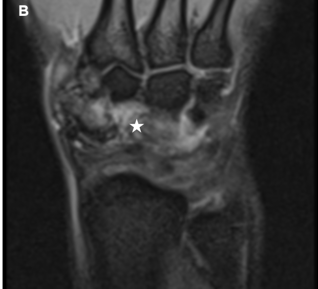
Figure 2. MRI of the left wrist in a coronal plane showing a large lobulated formation (white star) with irregular contours on the dorsal surface of the wrist, from the plane of the dorsal surface of the hamate to the plane of the scaphoid joint with the trapezium and trapezoid; the lesion presents an hypointense signal in T1 sequence (A) and an intermediate and heterogeneous signal in T2 (B).