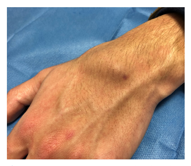
Figure 1. Nodular swelling on the dorsal surface of the left carpus at physical examination.

At this moment, the patient had a magnetic resonance of the wrist, which revealed a large lobulated formation with irregular contours on the dorsal surface of the wrist, hypointense in T1 sequence and with intermediate signal in T2 sequence (Figure 2A-B). The main diagnostic hypothesis suggested from these findings was a synovial proliferative process of undetermined nature.