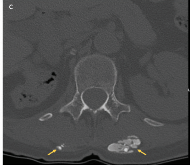
Figure 1. Paravertebral calcinosis. A. Anteroposterior radiograph of the spine showing a left paravertebral radiopaque lesion. B. Computed tomography (CT) of the spine (sagittal plane) revealing a calcified mass in the paravertebral muscles extending from the 12th dorsal to the 3rd lumbar vertebra. C. Cross-sectional CT image of 1st lumbar vertebra exhibiting a polylobed mass in the left paravertebral muscles and microcalcification on the right side.