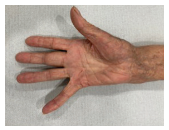
Figure 1. Right hand third digit swelling